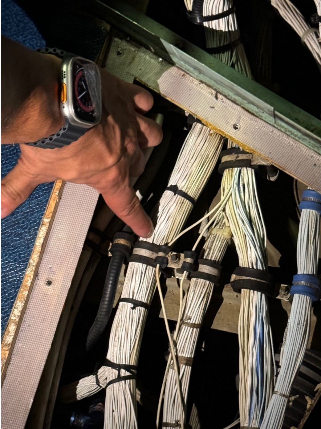
Cockpit location of the wire harness and the location of the detected and isolated intermittent wires. The intermittent wires are located next to the mounting clip.