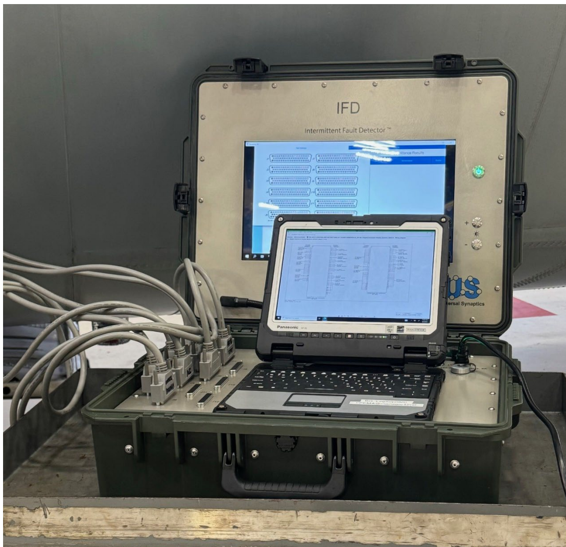
PIFD connected to the C-130 EIDS wiring harnesses.