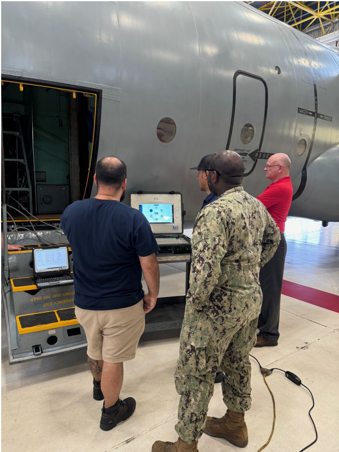
PIFD testing the C-130 EIDS